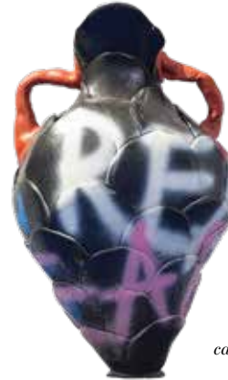
This vessel offsets your florals with a dash of punk. Vase Black, 2017, by Matteo Pellegrino campdesigngallery.com