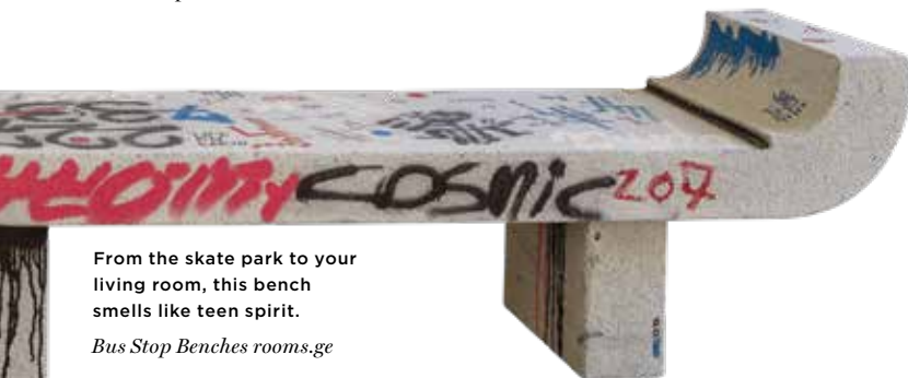
From the skate park to your living room, this bench smells like teen spirit. Bus Stop Benches rooms.ge