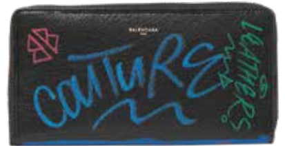
The perfect wallet for the anti-consumerist consumerist on your list. Bazar Graffiti Wallet by Balenciaga $750 net-a-porter.com