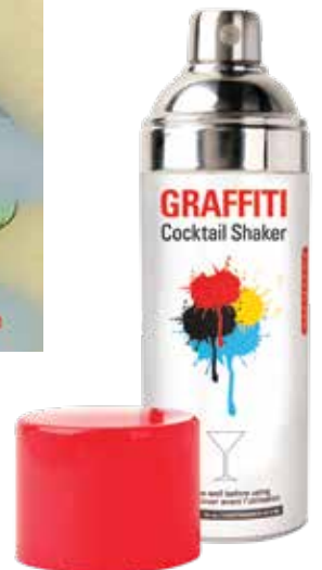
Barware for those who prefer shaken to stirred. Graffiti Cocktail Shaker $28 kikkerland.com