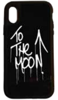
This Bushwick, Brooklyn, artist leaves his mark all over the city. To the Moon iPhone Case $50 gazootothemoon.com